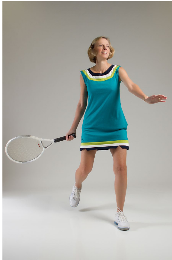
Fig. 3 2nd place design ( front view )

customers wanted. In particular, cotton blends with Spandex or Lycra were considered to be the best match with the design requirements for flexibility and movement because of their stretch and recovery properties.