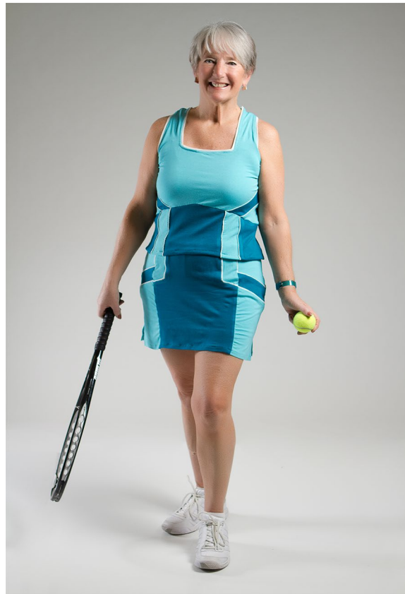
Fig. 1 1st place design ( front view )

Using a conceptual framework, we used Lamb and Kallal's (1992) FEA consumer needs model and Watkins's design process (1988) to guide the development of prototype tennis wear for female baby boomers. The first objective of the study was to identify the clothing needs of female baby boomers who play tennis regularly. The focus group interviews using the FEA needs model initially helped the students understand the clothing requirements of their specific target audience. The interview findings supported the FEA needs as important design criteria for baby boomers' tennis wear. The students translated the FEA design standards into garment attributes and used them to develop prototype tennis wear for their fit models (see Table 2). The designs, which incorporated the FEA design criteria, supported the tennis wear needs expressed by the focus group