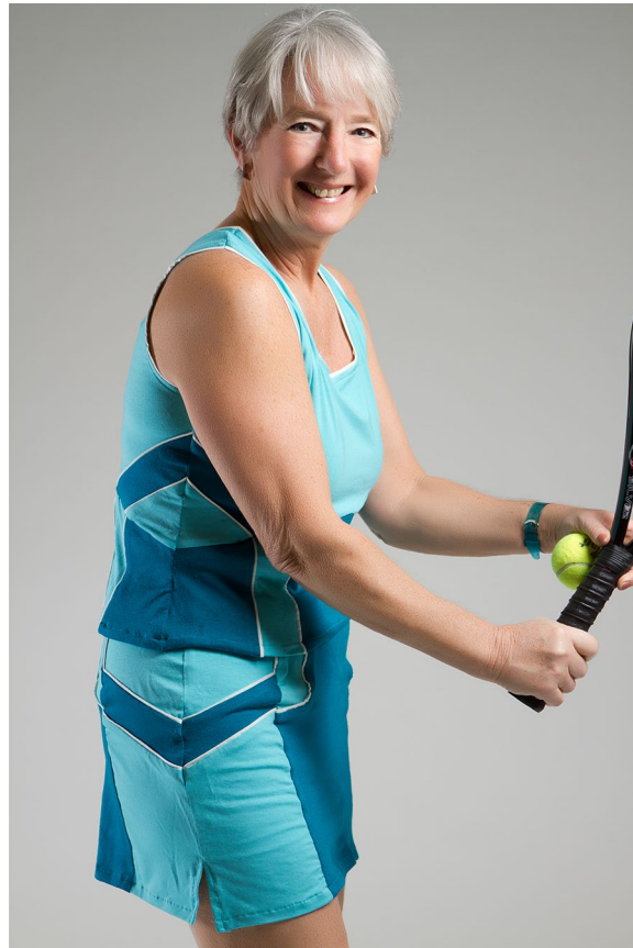
Fig. 2 1st place design ( side view )

participants; the students used the most important requirements, such as comfort, fit, free movement, age appropriateness, and a feminine and sporty look, to improve the quality of the tennis wear. The students improved their problem-solving abilities and creativity throughout the process of applying well-balanced FEA design criteria to create suitable tennis wear that female baby boomers desired.